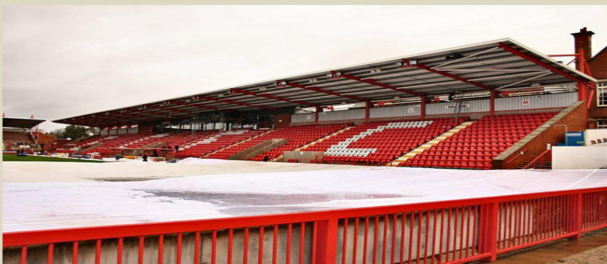
Ivor Doble Stand

At one end is the 'Big Bank' covered terrace, which was opened in February 2000 and replaced a former open terrace. This stand is quite impressive looking and with a capacity of just under 4,000, means it is now the largest terrace left in the Football League. Unusually both the Flybe & Big Bank Stands have an open gap between the roof and back of the stands.