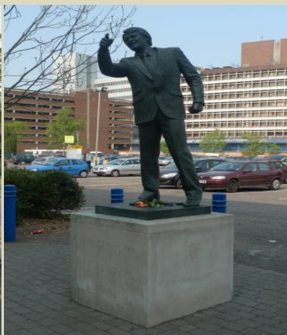
The Two Sirs Alf Ramsey and Bobby Robson