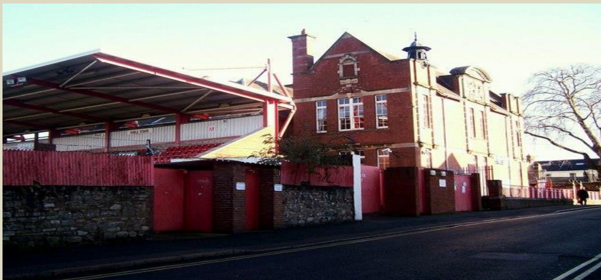
St James Terrace end

At one end is the 'Big Bank' covered terrace, which was opened in February 2000 and replaced a former open terrace. This stand is quite impressive looking and with a capacity of just under 4,000, means it is now the largest terrace left in the Football League. Unusually both the Flybe & Big Bank Stands have an open gap between the roof and back of the stands.