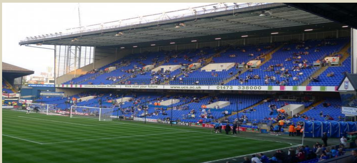
Sir Alf Ramsey Stand (South Stand)

On one side, the West Stand (East of England Co-operative Stand Stand) which is a three-tier covered stand, with a row of executive boxes running across its middle. This stand was originally opened in 1957.