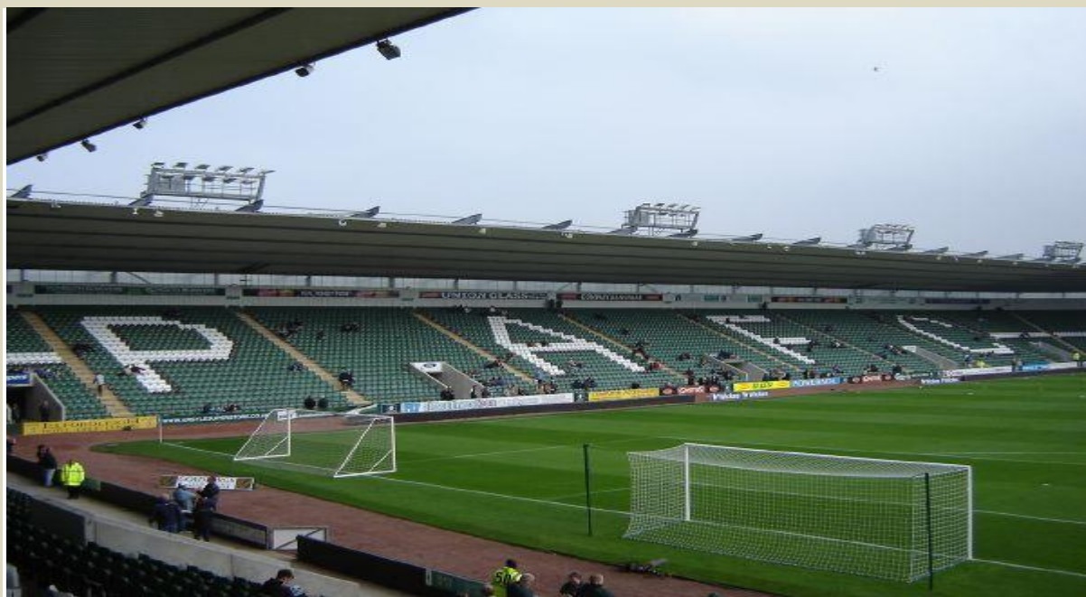
Lyndhurst Stand Doing the 116

The Lyndhurst Stand is the largest of the three, holding approximately 6,000 spectators, including the corners. The corner towards the East side of the ground is now the dedicated family area. The Barn Park End is where the away supporters are housed. Similar to the Devonport End, it also holds approximately 3,500 spectators. The standard allocation given to visiting clubs is 1,300 but this can be increased if demand requires it. All three boast good views and standard facilities for a football stadium, concourses, merchandise stands and food and drink outlets.