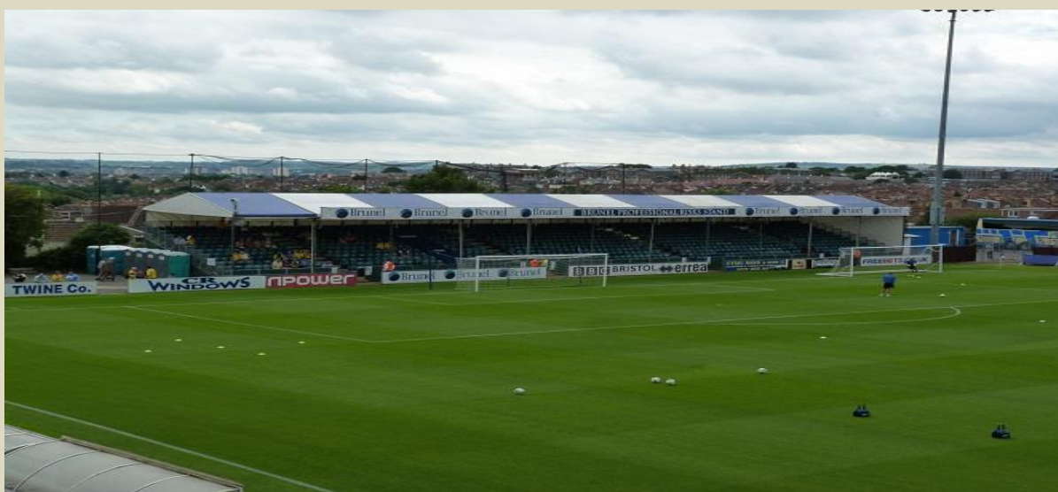
South Stand (Gibbo 92)

At one end is the unusual looking South Stand. This was originally erected as a temporary stand, to fill the previously empty end. It has now been opened for a number of seasons now, although it still looks, with its green seats and bright white roof, more suitable for an outdoor show jumping competition than a football ground. The stand only runs for just over half the width of the pitch, has several supporting pillars running across the front and has been nicknamed 'the tent' by Rovers fans. Opposite is the Blackthorn End, which is a covered terrace for home supporters.