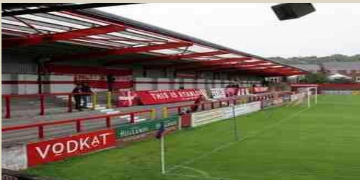
The Sophia Khan Stand

Opposite is a very small covered seated area, called the Whiney Hill side. This former terrace had seating installed before the start of the 2009/10 season, in order that the Club could meet Football League stadium criteria of having a minimum of 2,000 seats with further seating was also installed into the Sophia Khan End.