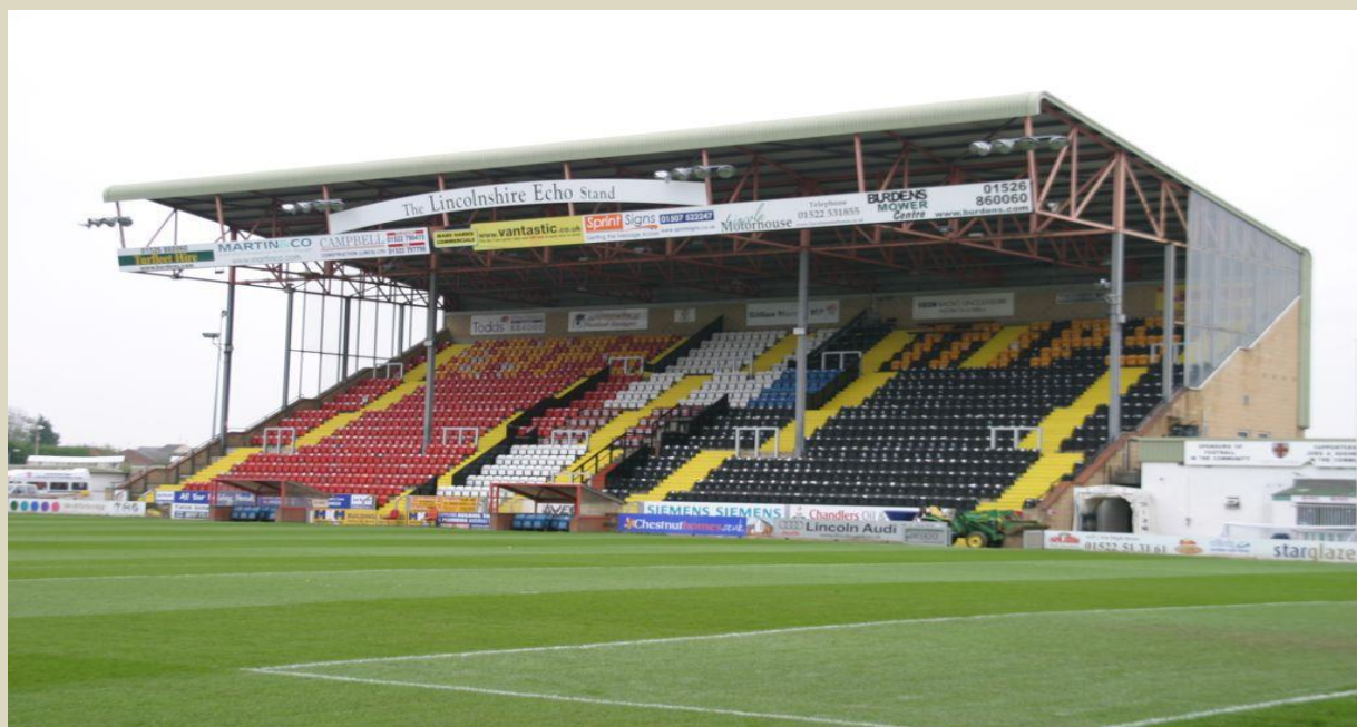
Lincolnshire Echo Stand