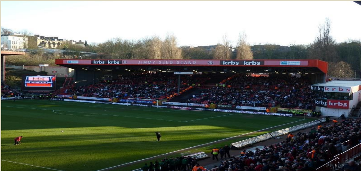
Jimmy Seed Stand (Away End)

In one corner of the stadium between the Jimmy (South) Seed & East Stands is a large video screen. Outside the ground there is a statue of Charlton's legendary former goalkeeper Sam Bartram.