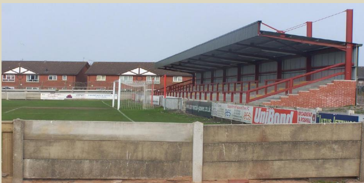
Percy Ronson Stand

Both ends are covered terraces, which are similar in size in terms of height. The Percy Ronson Terrace which is named after a former player who had most appearances with the old Fleetwood Town and which is given to away supporters and runs for around 65% of the width of the pitch where 831 fans can be accommodated. This terrace which was opened in 2007, is covered, free from supporting pillars and affords a good view of the playing action.