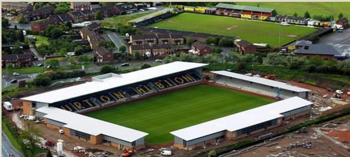
Eaton Park & Pirelli Stadium

Year Ground Opened: 2005 Undersoil Heating: No Shirt Sponsors: Tempobet Kit Manufacturer: TAG Website: www.burtonalbionfc.co.uk Programme: £3.00