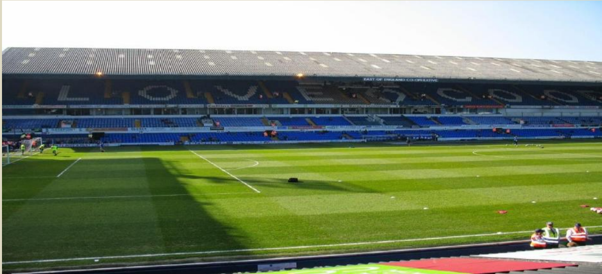
The East of England Co-operative Stand BGE

Food on offer inside the ground include; Rollover Hot Dogs (£3.30), Various Pies & Pasties (£3), including the tasty Portman Steak & Ale Pie (£3.50) and Jumbo Sausage Rolls (£3). They also offer a Pie & Pint/Drink deal.'