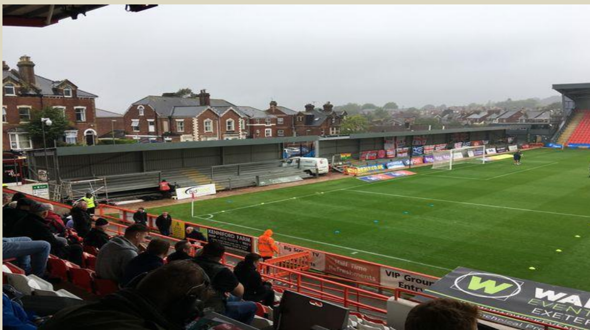
The St James End