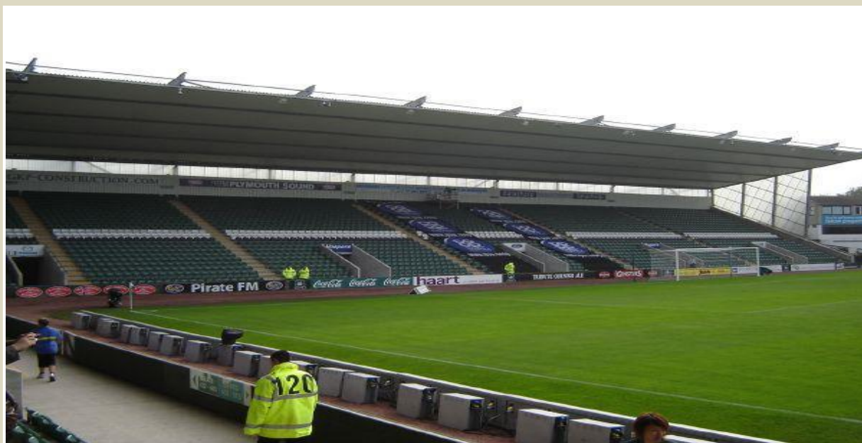
Barn Park End (Doing the 116)

The Mayflower Grandstand is the club's main stand, which can hold roughly 7,000 spectators. It was the oldest part of the ground, before being replaced by a new main stand. It houses the club's main offices, the boardroom, team changing rooms, press rooms and also accommodates executive boxes, which can host functions and are available to supporters during match days. The dugouts; which are made of wood and supplied by the club's sponsors; sit in front of the Mayflower, with the player tunnel slightly off centre going underneath the Mayflower.