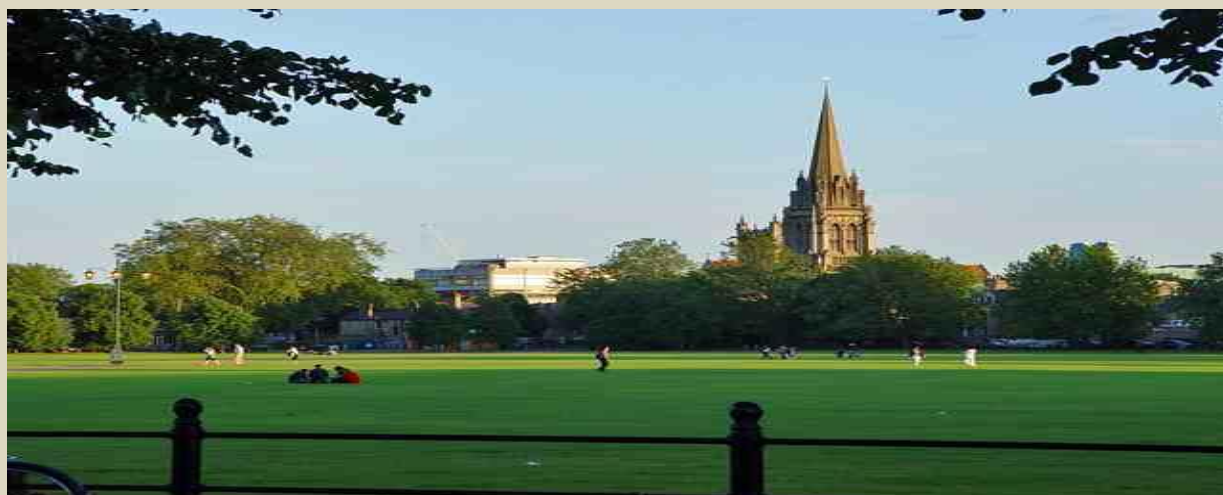
Parkers Piece (1912 – 33) (The birth of Football Association Rules)