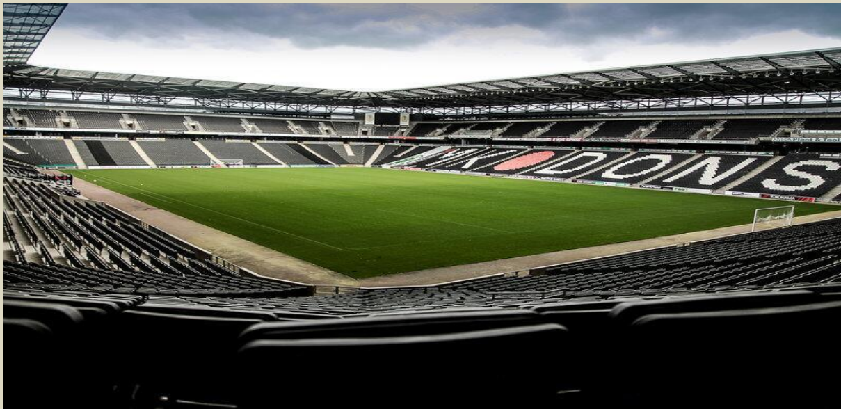
North & East Stands

The West side of the stadium is slightly different, with the seating areas in the upper tier being replaced by the Director's Box and executive and corporate hospitality areas. Unusually the spacious concourse areas at the back of the lower tier see directly into the stadium, so there is what seems a noticeable gap between the lower and upper tiers is where the concourse is located.