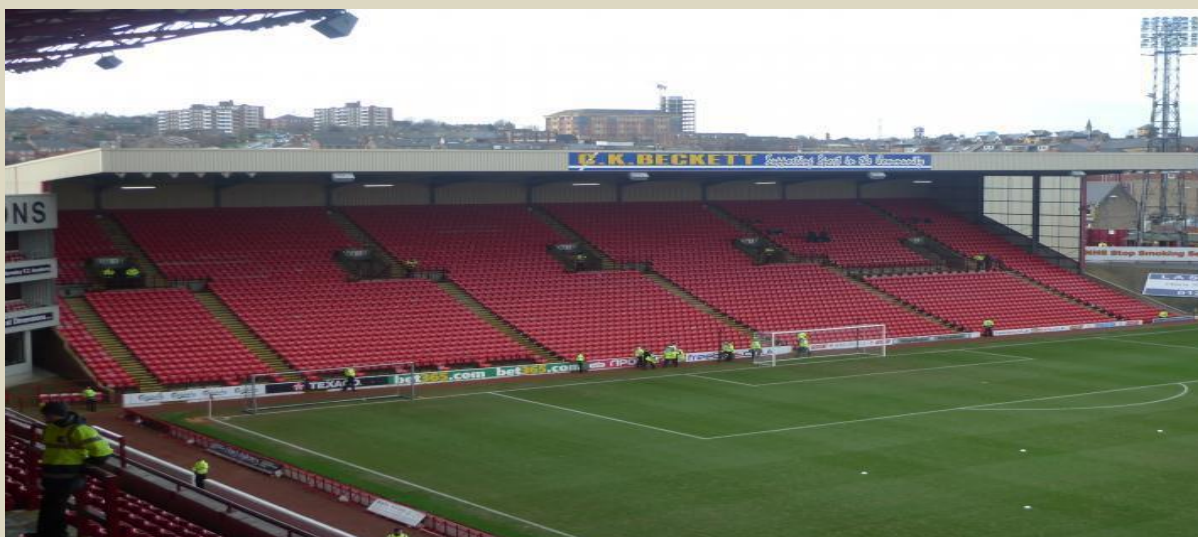
Pontefract Road End

At the Pontefract Road End is an all seated, covered stand for home supporters, which has a capacity of 4,500 and this stand was opened in 1995 and at the other end, the North Stand, was previously an open terrace, but is now a relatively new single tier, covered stand; Visiting supporters are seated in the North Stand. Who normally get about 2,000 to 6,000 fans varies according to demand and this is the most recent addition to the ground being opened in 1999 and has greatly enhanced the overall look of Oakwell with the North Stand being shared between home and away supporters.