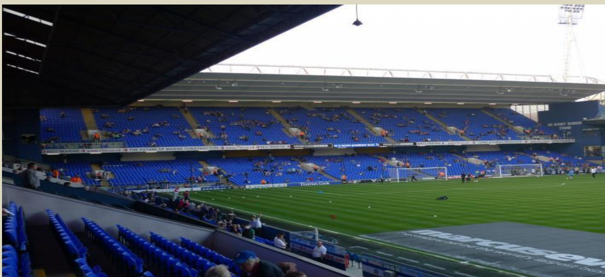
Sir Bobby Robson Stand

Exit from the A14 at the A12 Colchester junction. Follow the A1214 into Ipswich. You will go over two roundabouts, and several sets of traffic lights. When you get to the large set of lights, at the end of London Road, then you need to get into the middle lane, and go straight over the lights. At the next set of lights (beware these two sets of lights are only about 100 yards apart), then turn right into West End Road, past the BMW garage. Continue along West End Road for about a mile, and then turn first left into 'Sir Alf Ramsey Way' just after the bridge. Continue along 'Sir Alf Ramsey Way' for about 300 yards, and the ground is on your right.