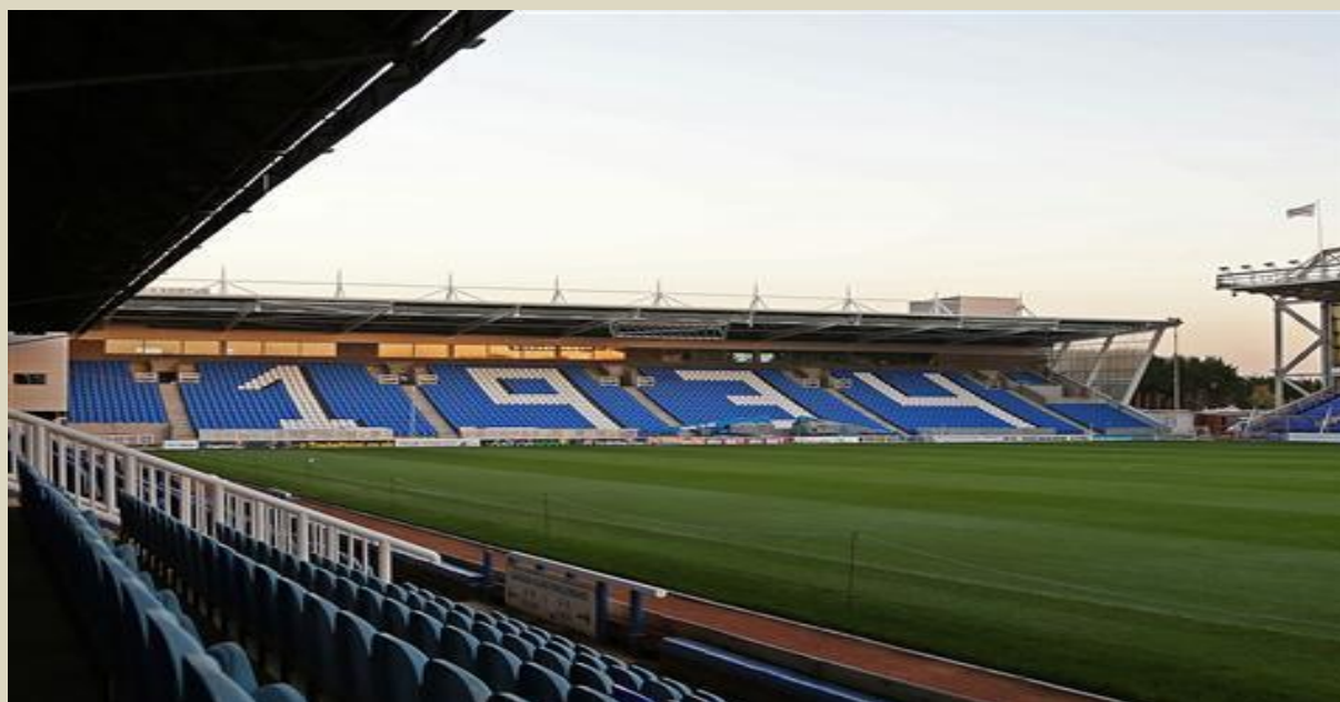
New Moy End (Motorpoint Stand)

The food available inside the ground includes the standard fayre of; Cheeseburgers (£3.50), Burgers (£3.50), Hot Dogs (£3.50), Various Pies including Chicken Balti, Steak and Cheese & Onion (£3.10), Pasties (£3.10) and Jumbo Sausage Rolls (£3.10) but get your food in the town its cheaper and there are many outlets.