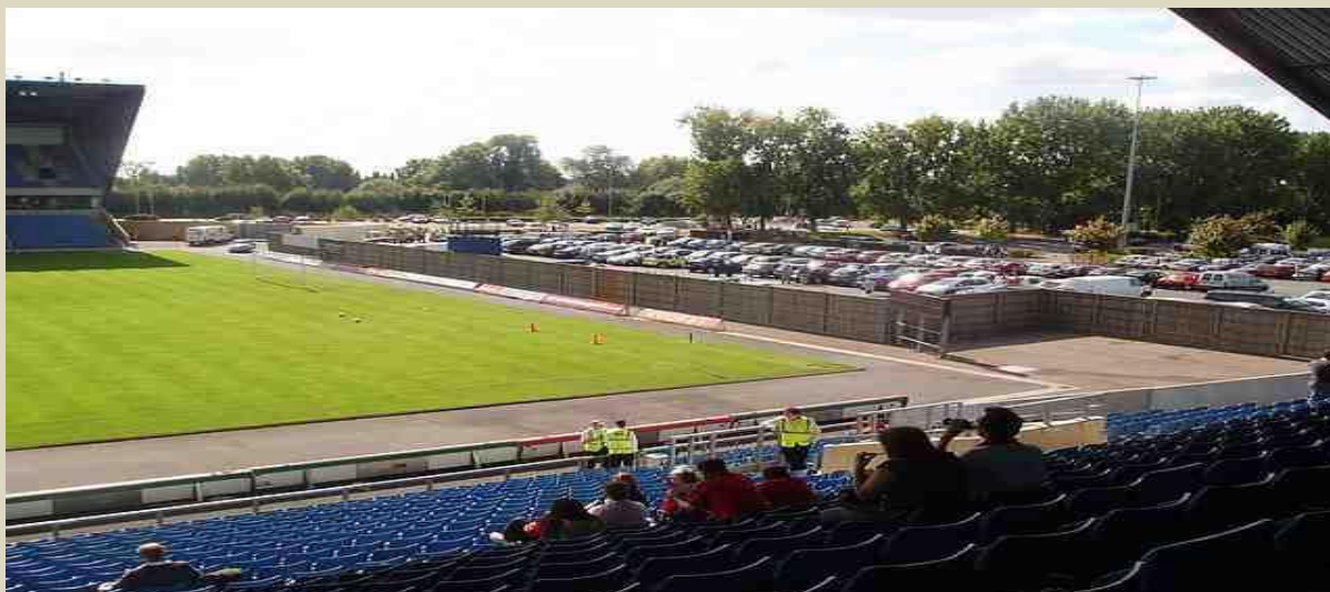
The West End

If you are heading in from Oxford Train Station then you will certainly not be dehydrated with the centre of town having numerous pubs of varying literary pretensions such as The Old Bookbinders Ale House and Jude the Obscure.