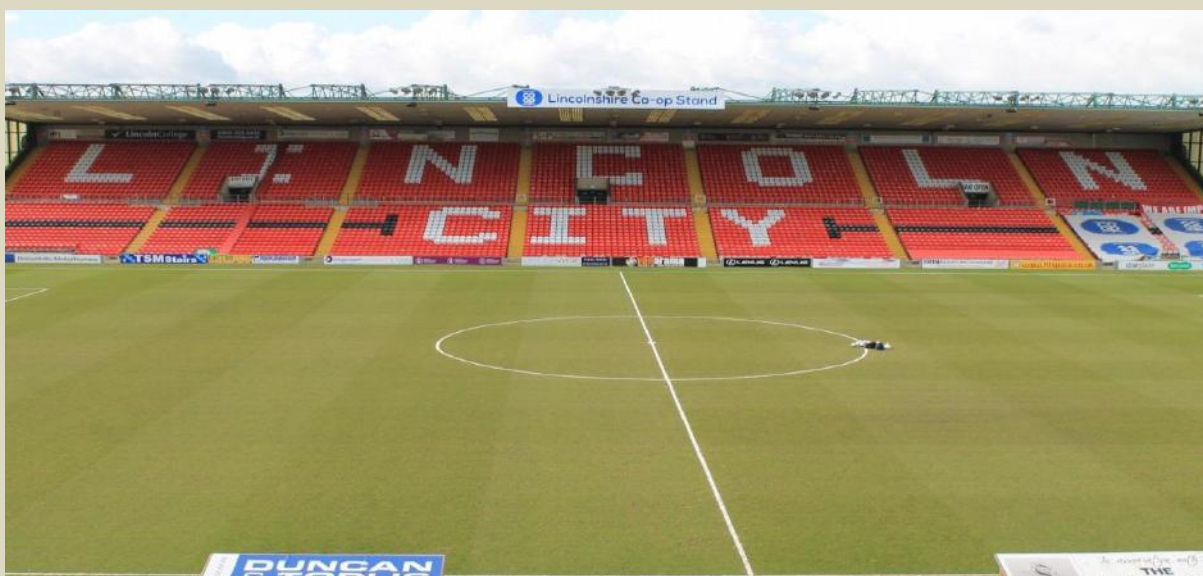
Coop Community Stand

The longer way from the Lincoln Railway Station is around a 19-minute walking pace to the ground unless you take in the pubs on the High Street. Turn 'left out of the train station and walk up to the traffic lights, turn left at these traffic lights onto the High Street, walking over the railway level at the crossing, keep walking for 10 minutes before turning left into Scorer Street, then walk along Scorer Street until you come to a bridge across the river, then turn right immediately after crossing the bridge onto Sincil Bank, the ground is straight ahead.