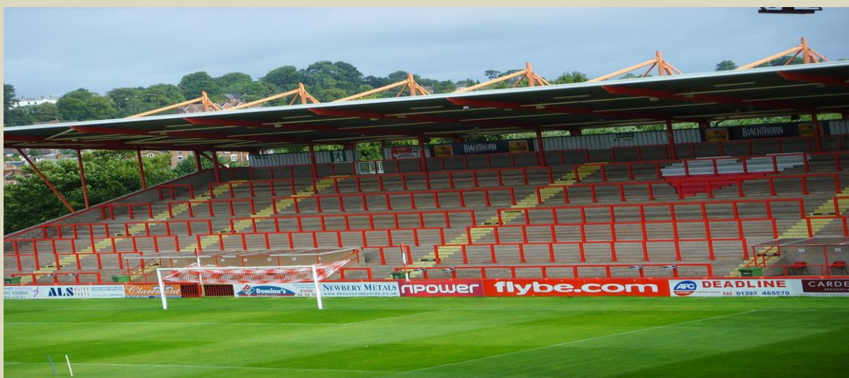
Big bank End

Exit the M5 at junction 30, and then follow the signs for Middlemoor. Take the second exit at Middlemoor roundabout (signed Heavitree). Follow signs for City Centre, going through Heavitree (approx. 2 miles). Past the police station on your right, then at the bottom of the hill turn right at the roundabout into Western Way (signed Pinhoe and Broadclyst). At the next roundabout, take the second exit, and then at the top of the hill (Old Tiverton Road) first left into St. James' Road.