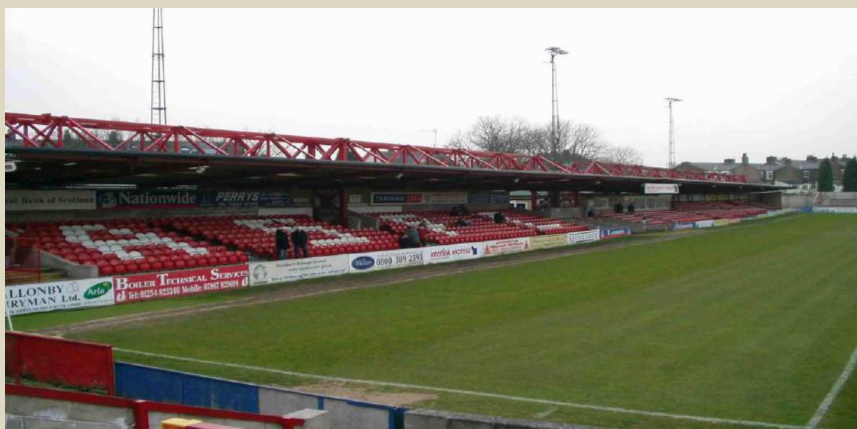
Main Stand & Thwaite's Stand

On one side of the ground is the Main Stand, which at first glance looks like one stand, but in fact it is comprised of two small stands; the Main & Thwaite's Stands. They sit on either side of the half way line, with an open gap between the two.