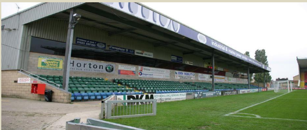
Bridge McFarlane Stand

The short way is to come out of the station and turn right to go down the road. About 30 yards ahead on your right you will see some steps and a bridge over the railway. Go over the bridge and once on the other side cross the car park walk down by the river, then take the path up to Stencil Bank and follow the road down to the ground which is on the left.