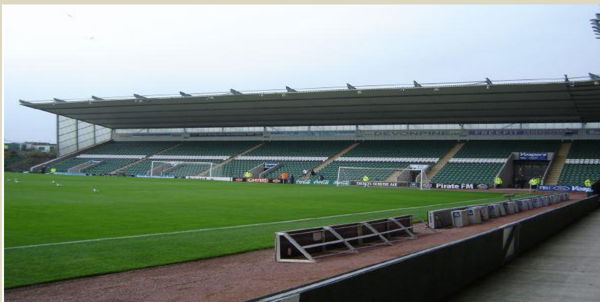
Devonport Stand (Doing the 116)

The Mayflower Grandstand is the club's main stand, which can hold roughly 7,000 spectators. It was the oldest part of the ground, before being replaced by a new main stand. It houses the club's main offices, the boardroom, team changing rooms, press rooms and also accommodates executive boxes, which can host functions and are available to supporters during match days. The dugouts; which are made of wood and supplied by the club's sponsors; sit in front of the Mayflower, with the player tunnel slightly off centre going underneath the Mayflower.